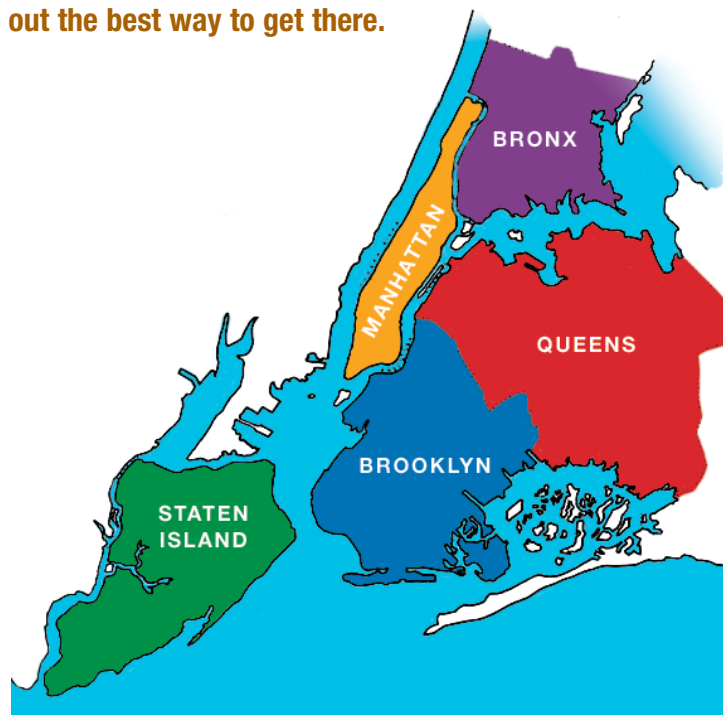
Chart your own 24 hours in New York City. Mark your destinations on the map, and figure out the best way to get there.